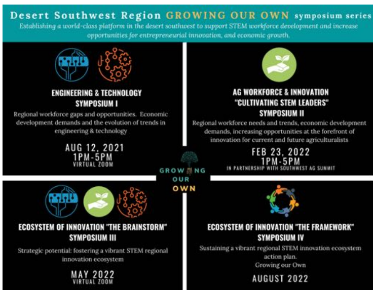
Figure 1. Growing Our Own Symposium series.